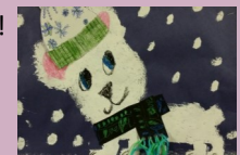
Alyssa W. 2

1st and 2nd grades recently completed sponge painted polar bears featuring patterns!