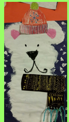
Cayden G. 2