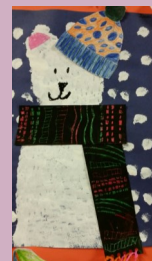
Isaac T. 2

Kindergarten, learning about the color spectrum!