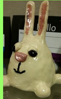
Rebekah S. 5